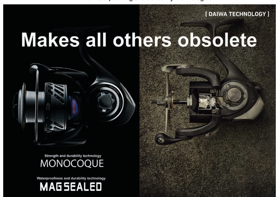
DAIWA's waterproofing and durability technologies

Meanwhile, in Asia, the Company will continue to make proposals for lure fishing and otherwise work to expand the market.