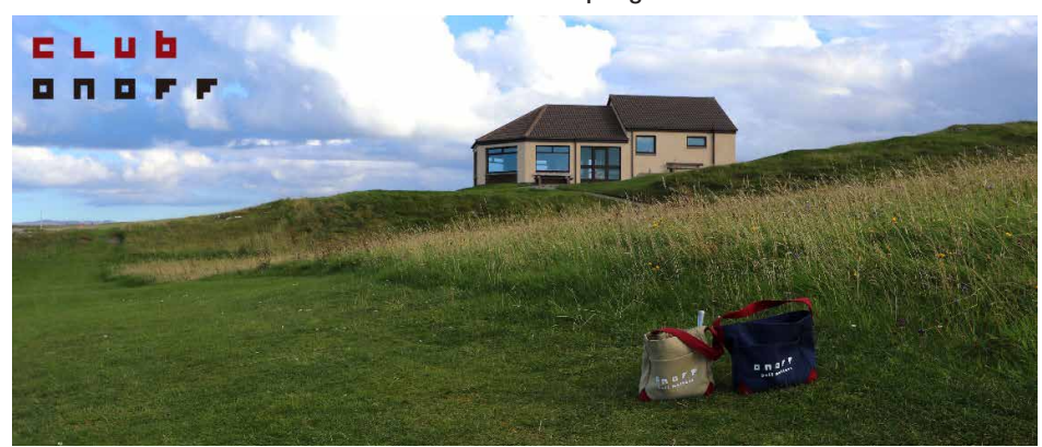
CLUB ONOFF membership organization

The membership organization holds test-hitting events exclusive to members. These activities put emphasis on fans and pursue steady improvement of brand value and stable sales growth.