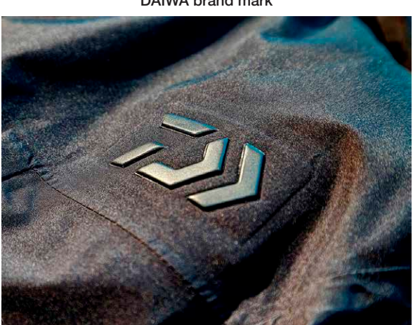
DAIWA brand mark

The Company began as a specialty manufacturer of fishing products, but started to diversify by starting sales of golf products in Japan in 1972. It moved into tennis products in 1980 and cycling sports products in 1990. The new name GLOBERIDE was adopted in 2009. The Company has a corporate motto of being a "lifetime sports company" that enriches life, and its main fishing business is known throughout the fishing world. The brand is very highly regarded, and as a top brand, based on the principle of changing lives to make them more exciting from experiencing "Feel Alive (the ultimate moment)" through fishing, the Company has evolved the concept of fishing goods and captured the hearts of fishing fans by consistently delivering innovative products to the market. The DAIWA brand mark receives robust consumer support as a symbol of challenge, originality, and innovation. Support for the DAIWA brand is extensive not only in Japan, but also worldwide.