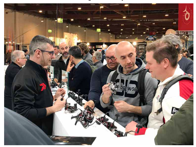
Fishing show in Italy